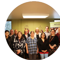
Seneca Warm Line